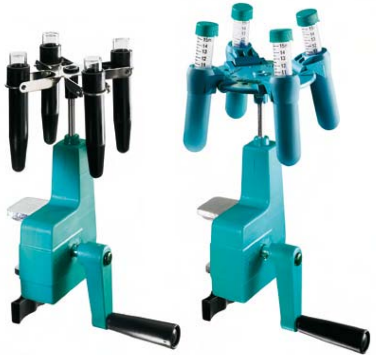
illustrated with rotor 1014 ↘ 90°

Rotor 1025 also accommodates a variety of other commercial tubes (also with round bottom) up to 15 ml. The tubes may have a max. length of 125 mm and a max. diameter of 17 mm.